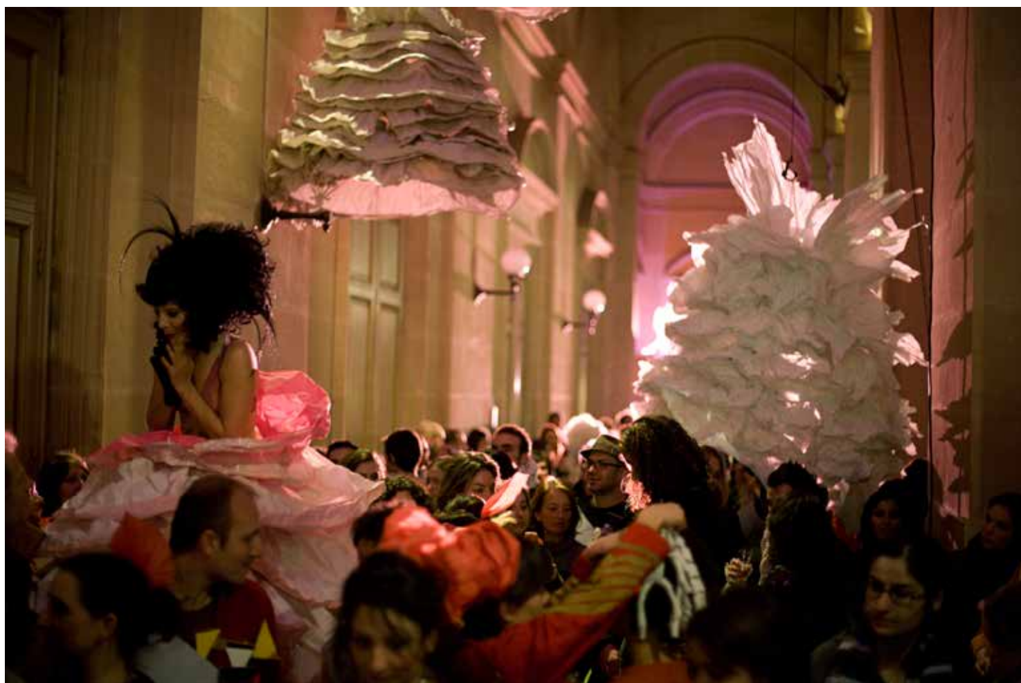
EVELYNE HOUSE OF SHAME Traces 2009-2012

Palais de la Bourse in Marseille, February 13th and 14th 2009, in partnership with the MerlanTheatre.